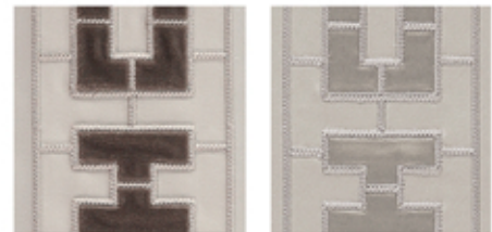
Smoke on Cream