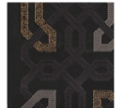
Beige on Cream