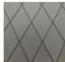
Ghost Tree Chalk Marks Arch8 Faux leather