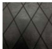
Bilbao Coulter Whistler Leather