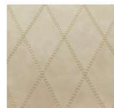
Escondido Auniq Arch8 Faux leather