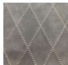
Escondido Resort Arch8 Faux leather